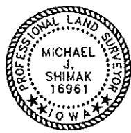
S 1/4 Corner Section 36 T97N R11W Set 1/2"Ø rebar w/2"Ø aluminum cap PLS 16961